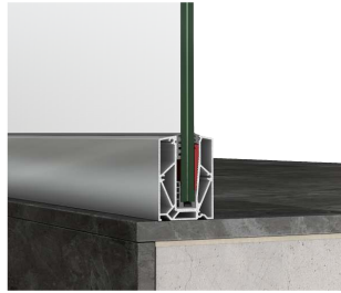
M8207 on-floor, with 8+8mm and 10+10mm glass