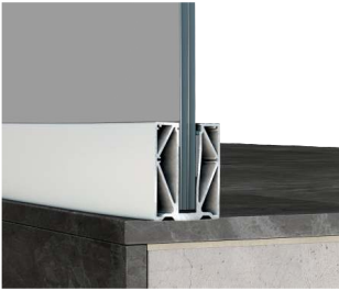
M8200 on-floor, with 8+8mm and 10+10mm glass