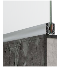
M8209 on-floor, with 5+5mm, 6+6mm and 8+8mm glass up to 70cm height