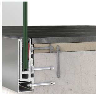
M8202 side-mounted, with 8+8mm and 10+10mm glass