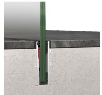
M8210 in-floor, with 8+8mm and 10+10mm glass